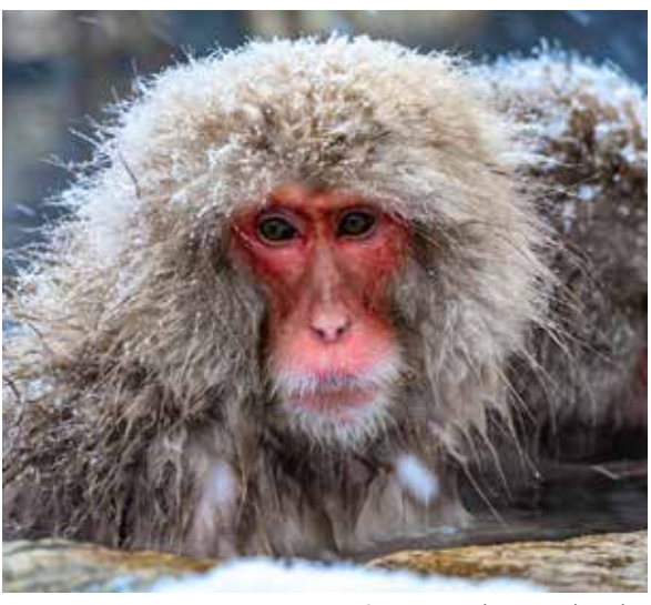
Snow Monkey, Yudanaka